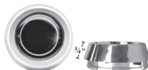
CAPS- 3/4" tall cap included with 17" wheels