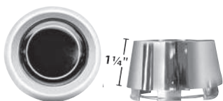
CAPT-1 1/4" tall cap option for 17" wheels