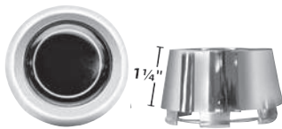
CAPT-1 1/4" tall cap option for 17" wheels