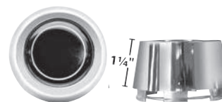
CAPT-1 1/4" tall cap included with 15" wheels