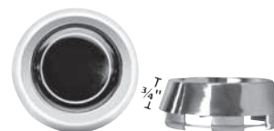
CAPS- 3/4" tall cap option for 15" wheels